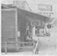
1955-1957 Main St.