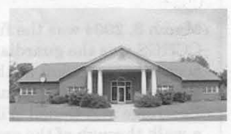
1995-Present Indiana Avenue

2004 marks the 50th anniversary of the Crawford County Public Library. An open house celebration is being planned for August 14.