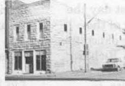
1970-1995 West Fifth St.