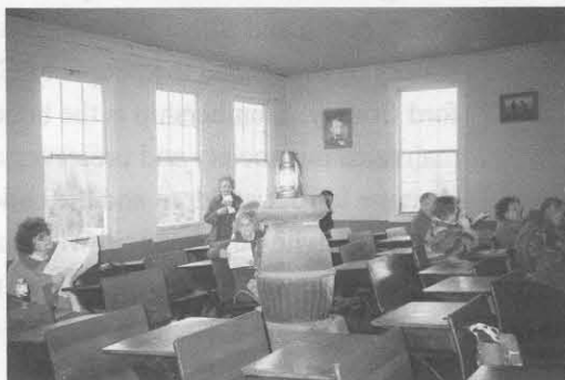
CCH&GS members and guests