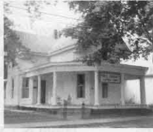
1957-1969 East Fifth St.