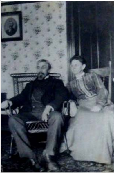
David L. Rice Library www.usi.edu