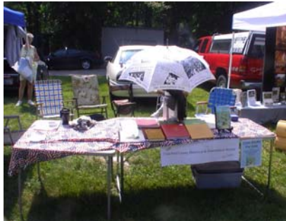
Our booth at Leavenworth.