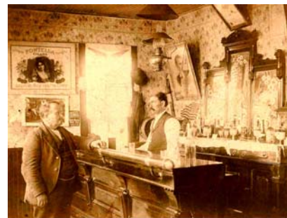
Tavern in Marengo, undated