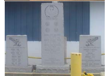
Alton Legion Hall, a recent photo.