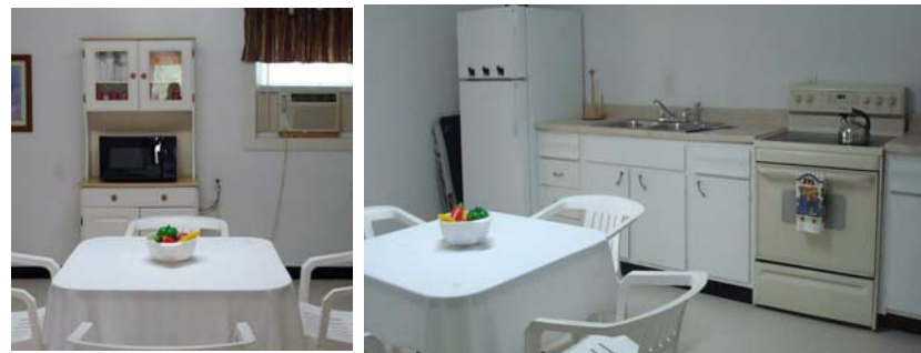
The New Proctor House Kitchen in the shelter house, completed in August by the Proctor House Committee with the help of all who assisted in our last Proctor House Yard Sale!