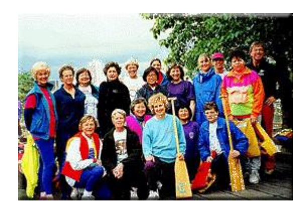
The original Abreast in a Boat team www.abreastinaboat.com

From a medical study involving one boat of 25 women in 1996, the organization has now grown to include five boats based in Vancouver and has inspired many other teams to form. Read articles about the medical history of Abreast In A Boat in the Canadian Medical Association Journal: August 1998 October 1996