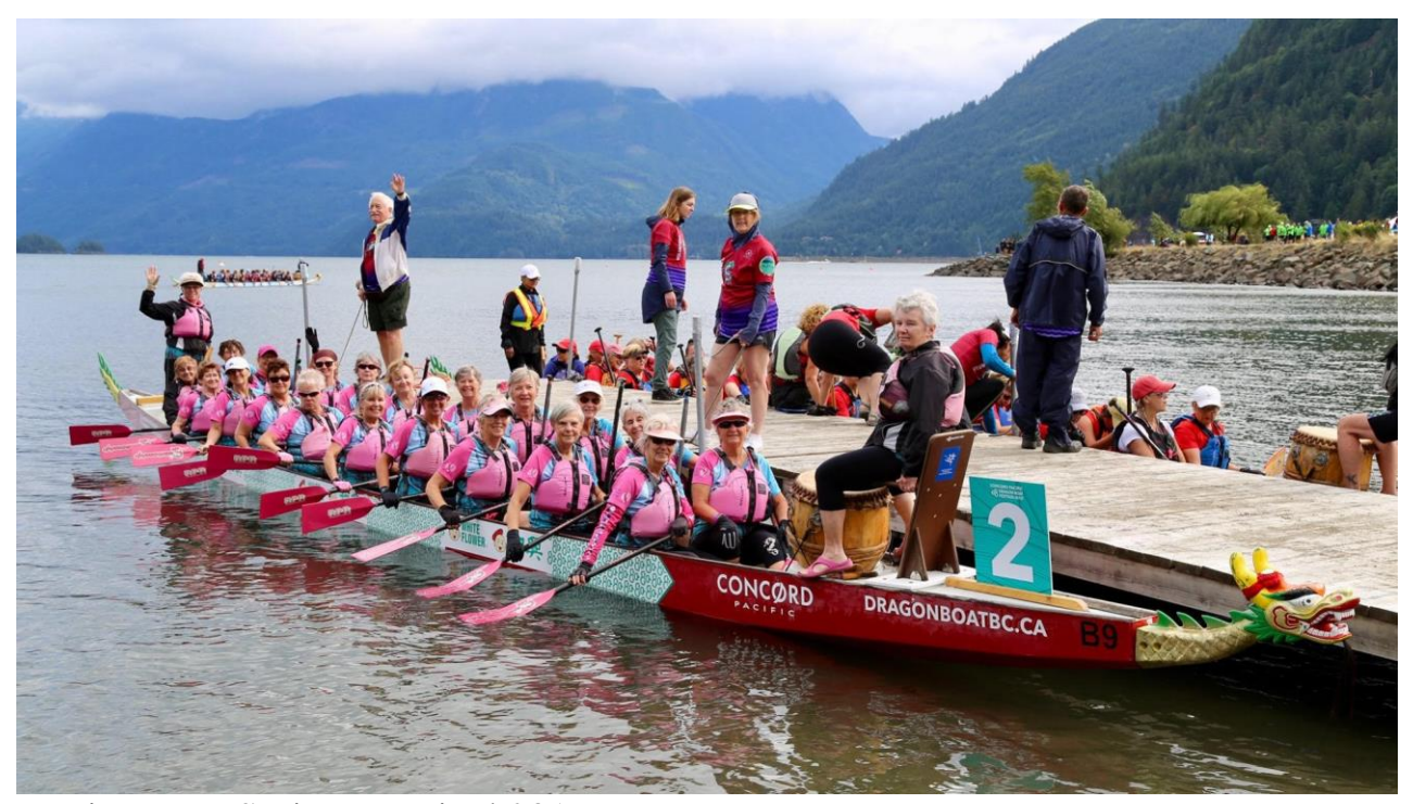
Harrison Hot Springs Festival 2019

Although this manual is written for paddlers, the training principles herein are easily adaptable for almost any sport. One of the goals of participation in Dragon Boating paddling is to instill the desire to make exercise a habitual and lifelong activity. It's wonderful to be STRONG!!!