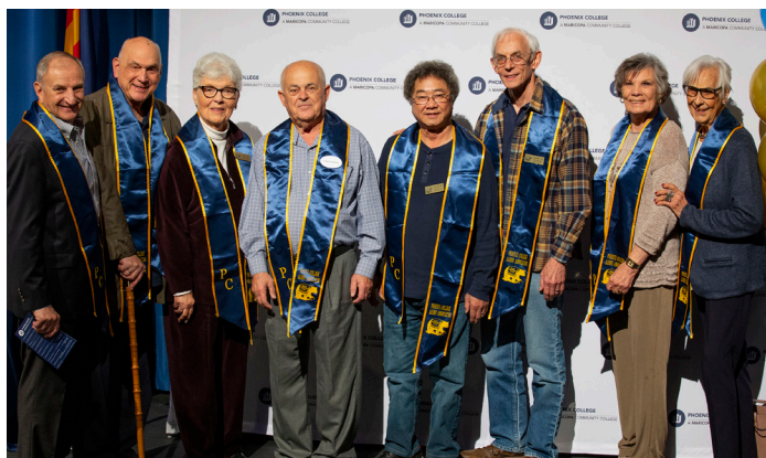
Induction of the Half Century Club – Phoenix College Alumni who graduated at least 50 years ago.