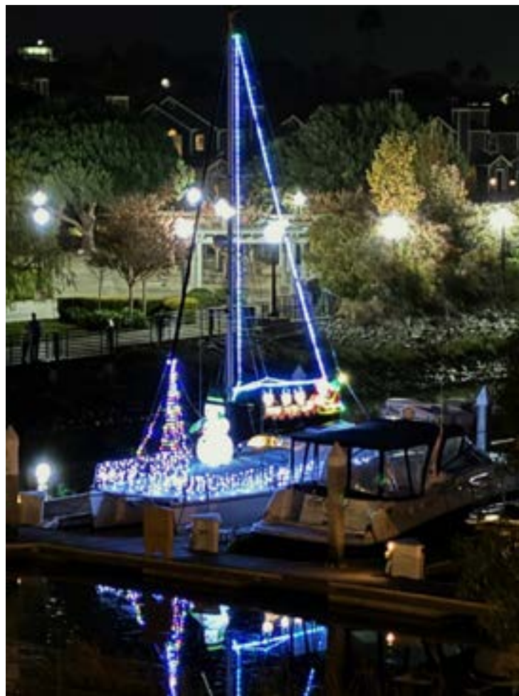
BYC boats, lit up for the holidays in preparation for the annual Lighted Boat Parade