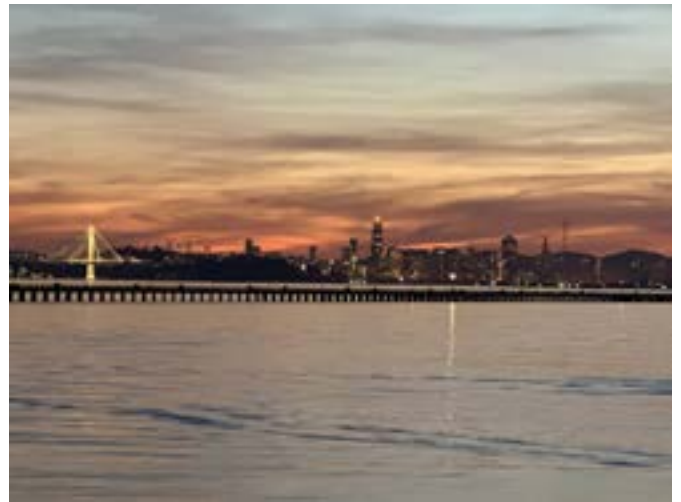
▲ Sunset behind San Francisco, with the Bay Bridge