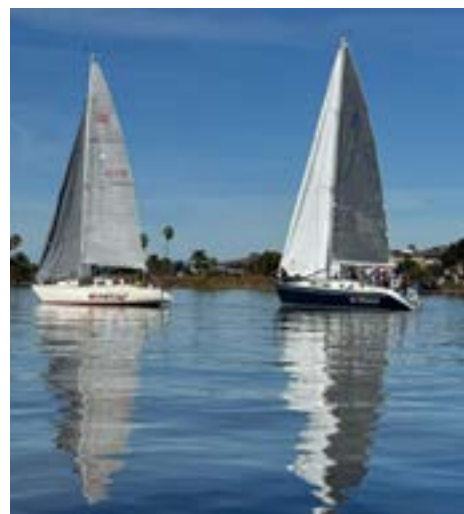
▲ Frostbite Race 1 Oh boy, looks like the Benicia Doldrums.

Our first RC meeting for the new season is Thursday, December 4th at 7:00 PM . Come help us continue growing our successful BYC Racing Program.