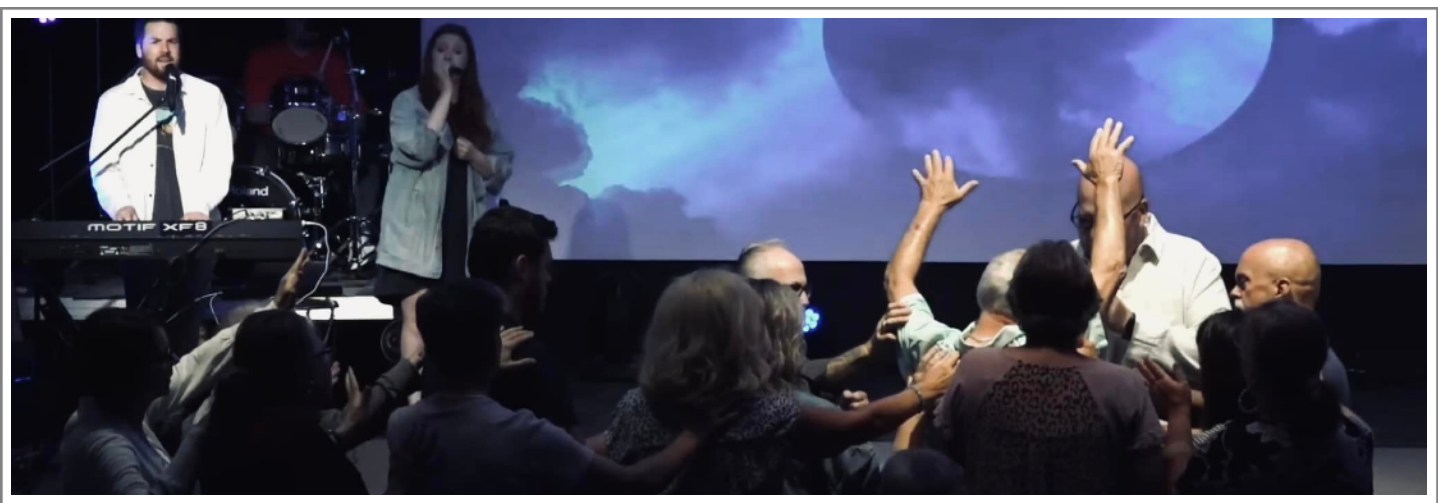
Above: From this moment of worship and prayer for one of our Family2.0 members, God has released an anointing for writing original praise and worship music from right here at 5 Stone Church! This is a beautiful picture of the beginning of the song "I Reach For You." (now available on iTunes)