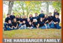
THE HANSBARGER FAMILY

Family Owned & Operated for Over 48 Years