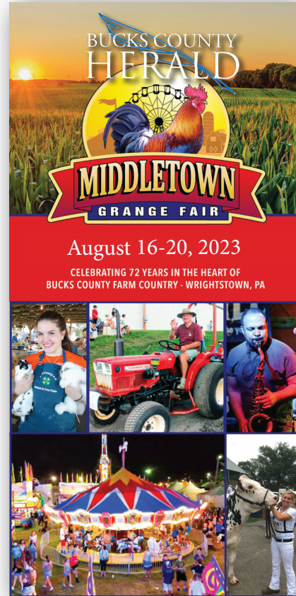
The Grange Fair Premium Book