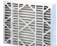
CX3000-RFGS MERV-11 Filter