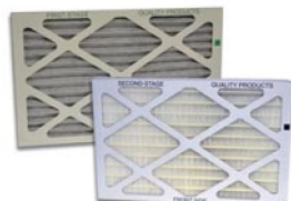
CX1000-RF Filter Set