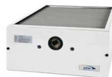
CX3000GS Ducted Air Purifier