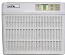
CX1000 Portable Air Purifier