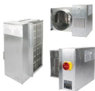
Duct and Make Up Air Heaters

STELPRO Electric Infrared Heaters commonly referred to as a "patio heater," the SIRH infrared radiator makes it possible to extend outdoor events during the cooler seasons. This sturdy, weather-resistant heat radiator made of aluminum and with a stainless-steel grill is designed for applications where significant air temperature exchange occurs. STELPRO Electric Infrared Heaters range from 5,000 to 20,000 BTU.