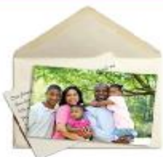
Letter & Photo