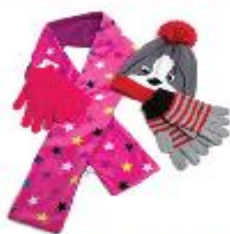
Hats, Gloves & Scarves

Watch the newsletter each month for the item of the month! #OCCitemofthemonth