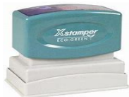
(2) X-Stamper Handle