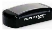
(3) Slim Stamp