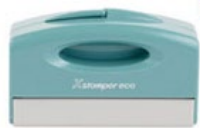
(1) X-Folding Pocket