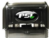
Same Day Delivery