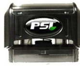
Same Day Delivery