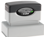
Same Day Delivery