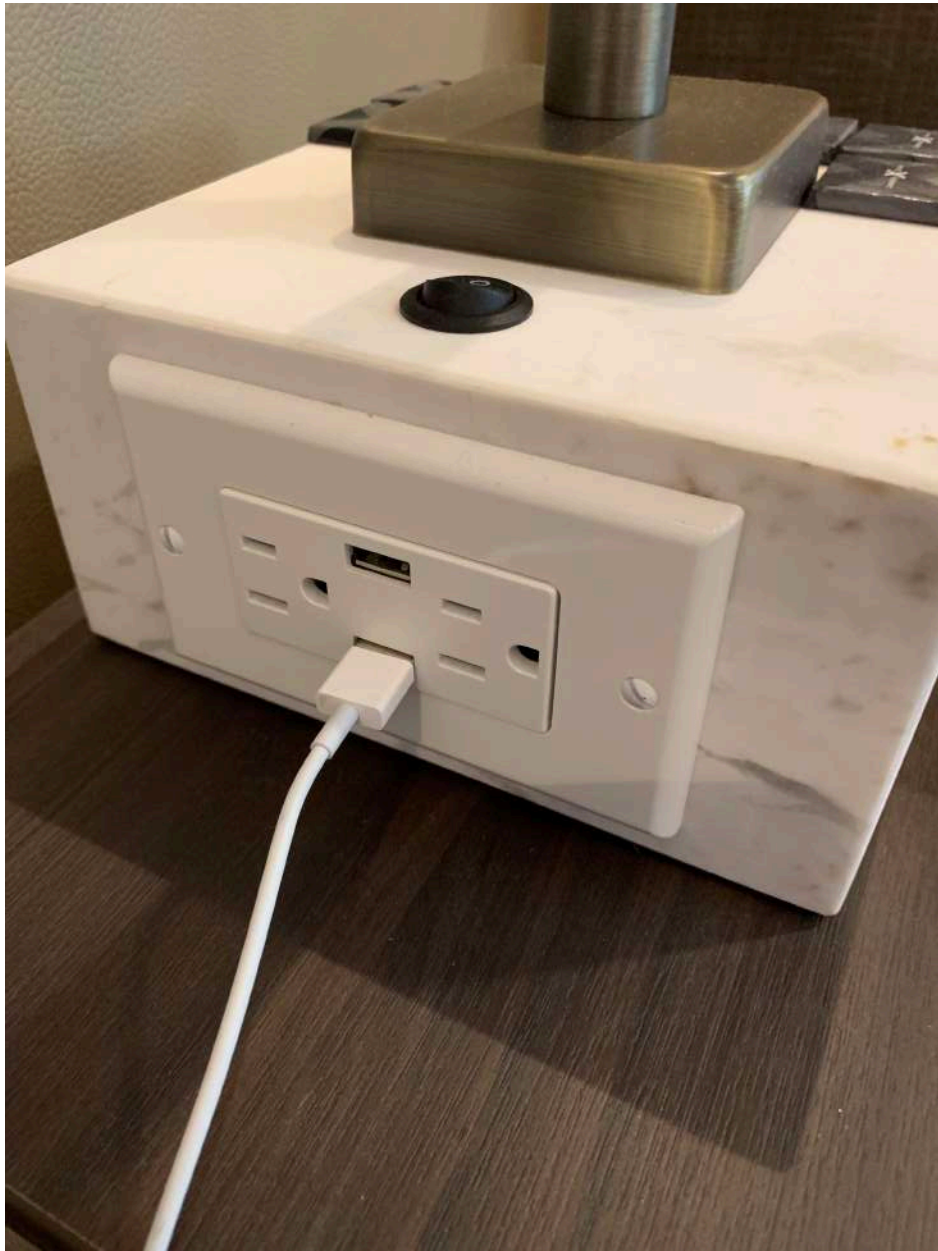
Outlet next to the bed