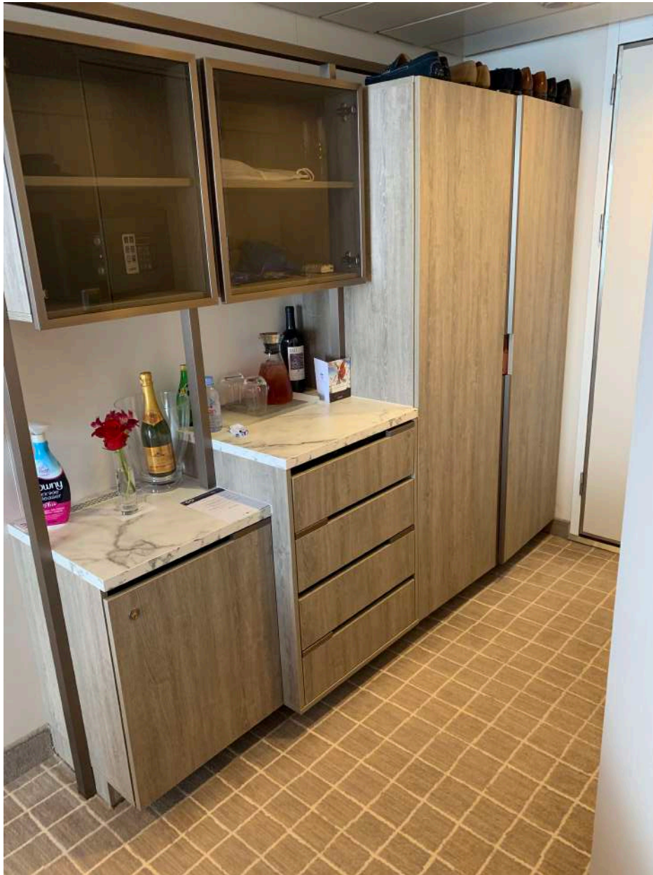
Here is the storage area and wardrobe. Minibar is on the bottom left. Four drawers are located between the wardrobe and minibar. The storage above we didn't utilize much but is good extra storage. You'll see the safe is on the left portion. Notice on top of the wardrobe is also a place to store things. We found it useful for some shoes.