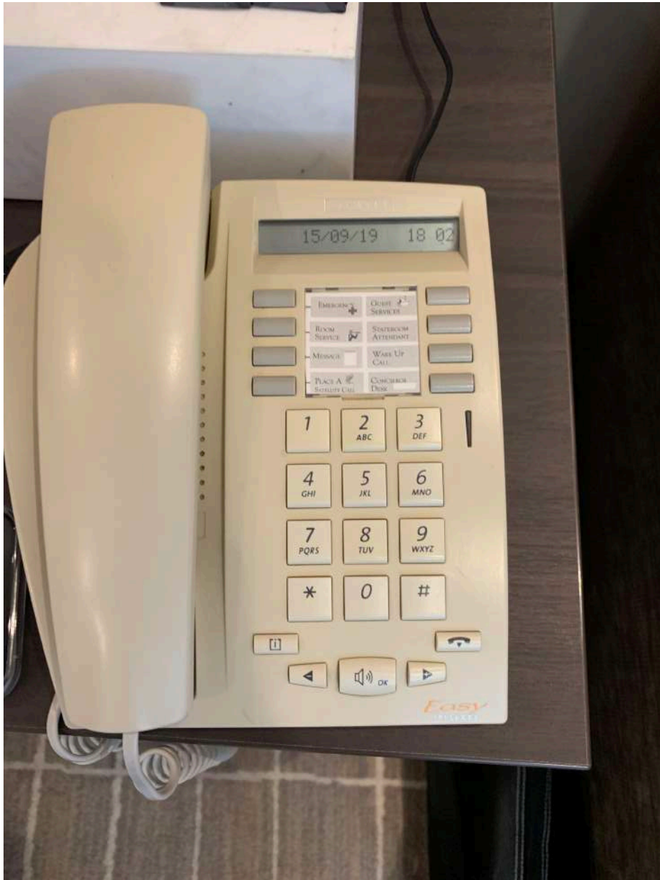
The old phone! Come on now!