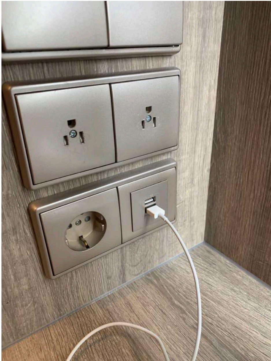
Outlets on the desk