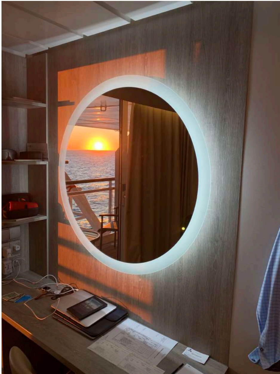
Desk mirror lit up at sunset