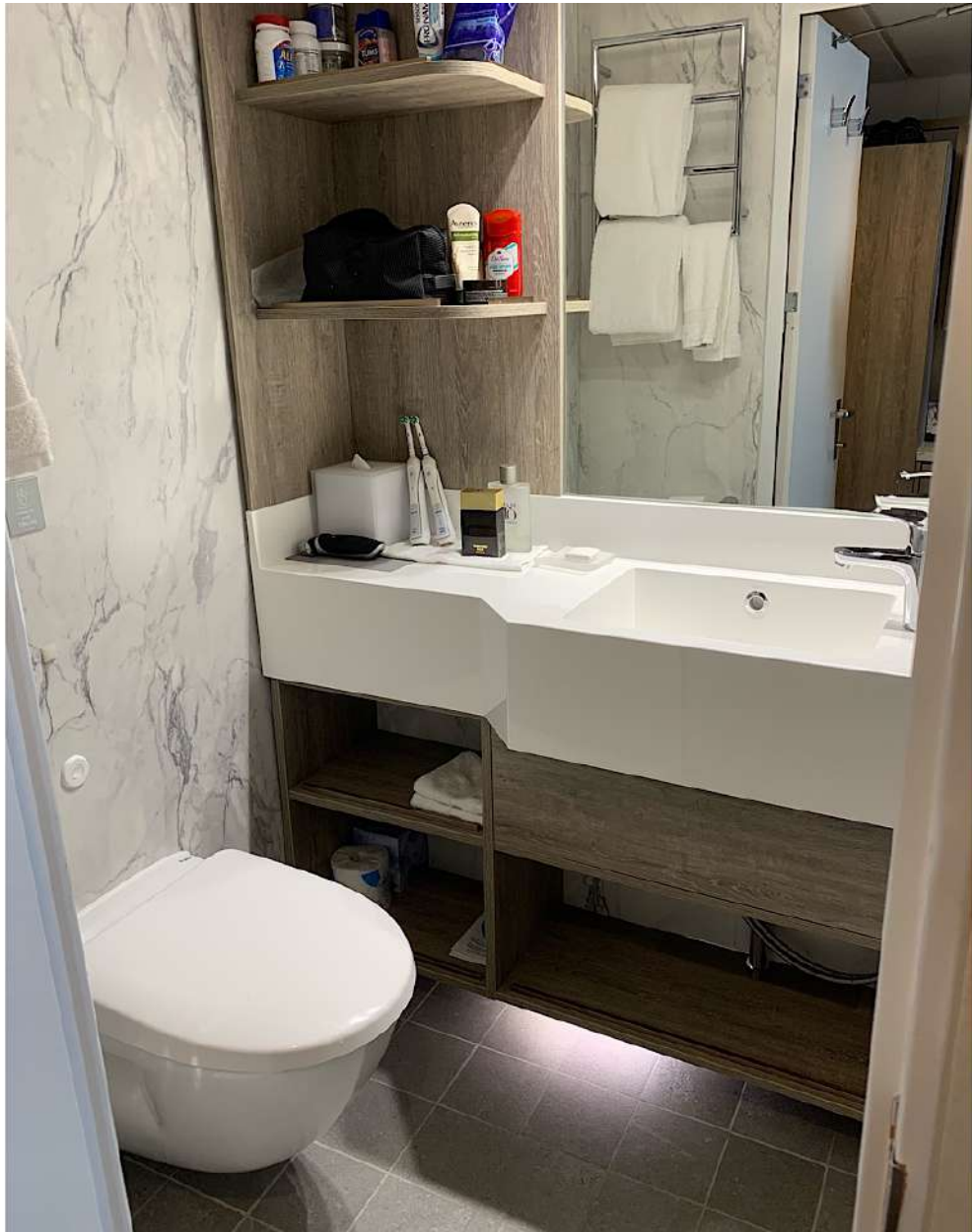
Notice all storage is open, but it gives the bathroom a much less closed in feel.