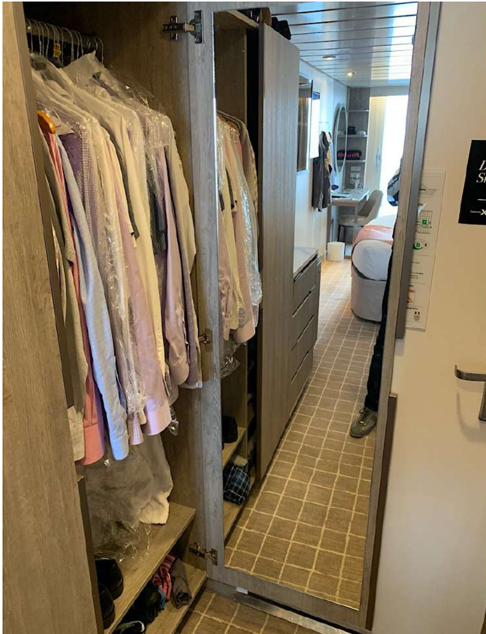
There is a full length mirror inside the wardrobe. You'll notice inside there is also additional shelf space at the bottom for storage. The same is true of the other side of the wardrobe.