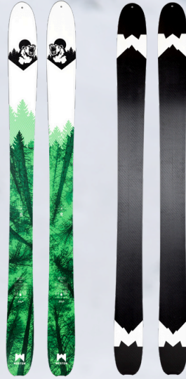
WESTON BACKCOUNTRY GRIZZLY (166, 176, 186CM)

The Best Ski for: Powder + Freeski - Trees, Powder & Steeps