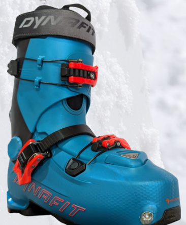
Hoji PX W