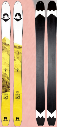
WESTON BACKCOUNTRY SUMMIT (166, 176, 186CM)

The Best Ski for: All-Mountain - Steeps, Trees & Good Snow