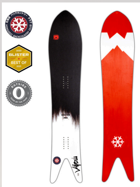
WESTON BACKCOUNTRY JAPOW X HBC (159, 164CM)

The Best Solid for: Niseko Powder - Snow Surfing & Trees