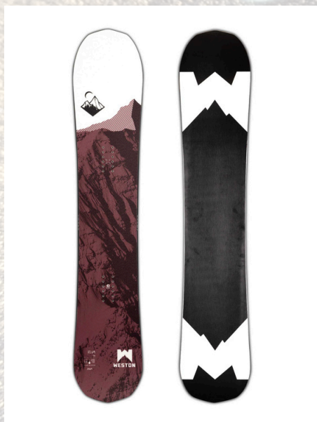
WESTON BACKCOUNTRY RIVA (153CM)

The Revel is the women specific powder board similar to the Japow! Snow surfing at its finest!