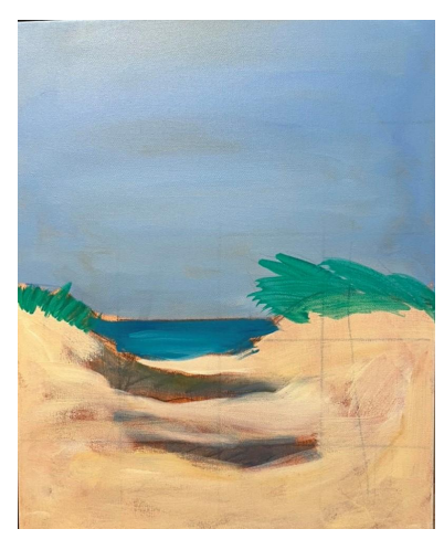
Step 3 : This is my "color map" where I do a light wash laying out my basic colors.