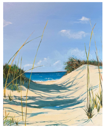
Step 5: More layering and adding detail. Still working toward intense lights and darks. This is the stage