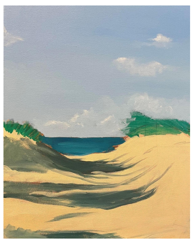
Step 4 : Now I start adding detail and layering the paint. This is also where I aim for dramatic contrasts,