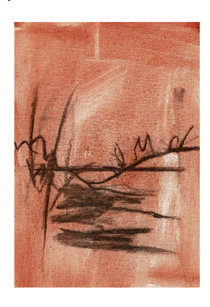
Step 2 : This is a burnt sienna stain that "kills the white". There are two reasons for this step: it allows me to see more contrast between the lights and darks and it also creates a rich undertone for layering.