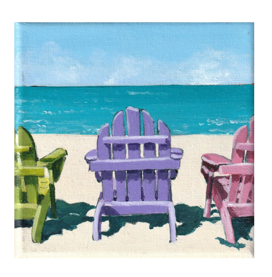
"Waiting For Friends"