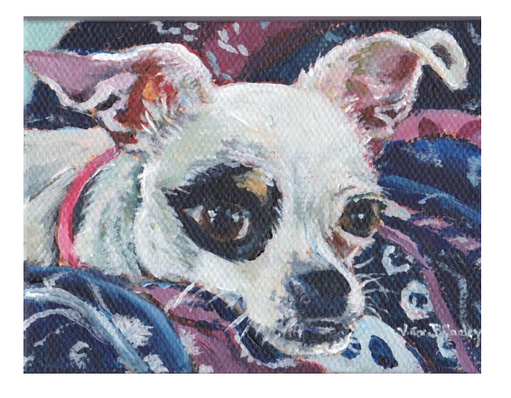
Custom Pet Potraits