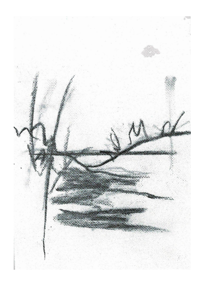
Step 1 : I use charcoal to create a very rough layout of the subject matter.

I often get questions about how I begin a painting and how I know when it is finished. Over the years, I've fine-tuned my process to include roughly 5 steps. Just for fun, I've broken down the steps for my new painting, "Walk This Way".