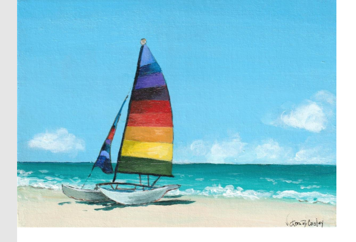
Come Sail Away