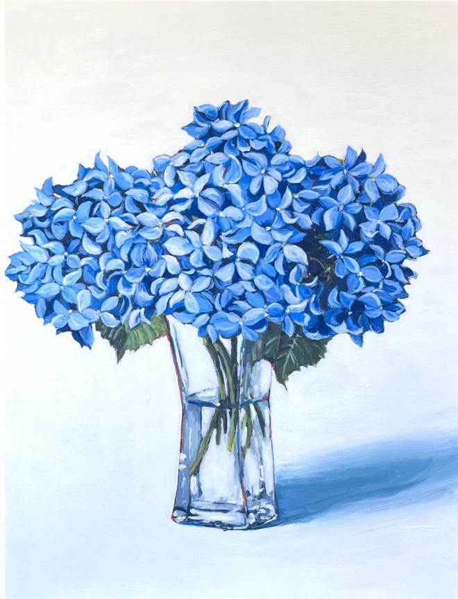
"Nantucket Beauties" 18" x 24" on gesso board