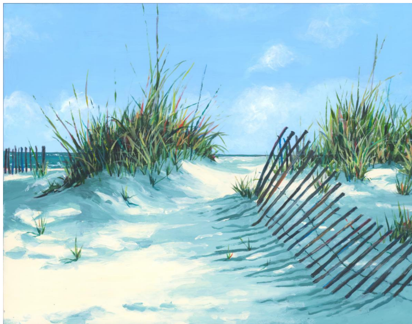
"Madaket" 18" x 24" gesso board