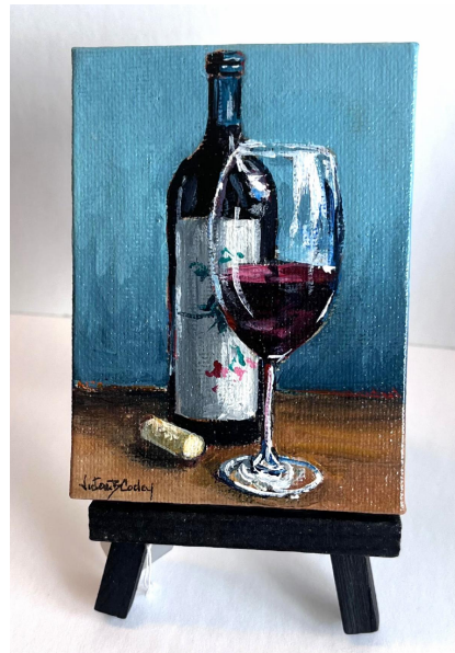
"Wine Tasting" 3" x 4"