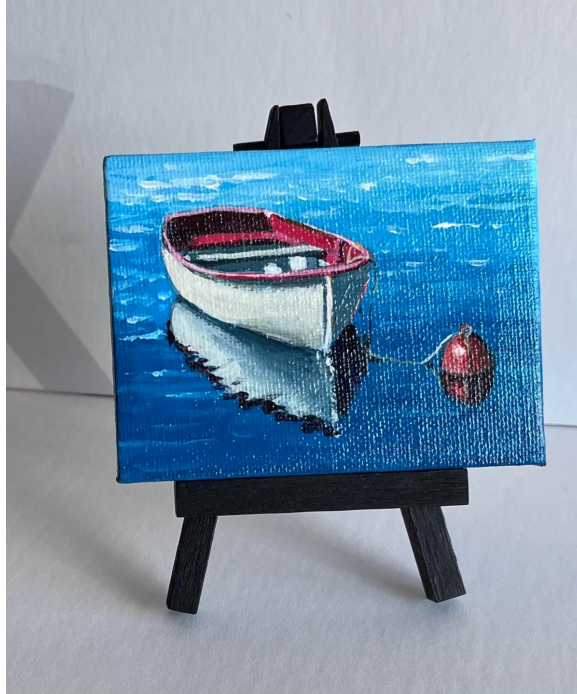
"Red Buoy" 3" x 4"