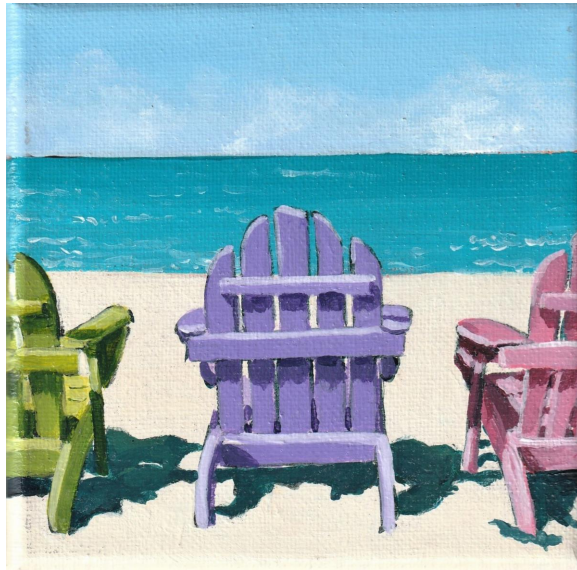
"Waiting For Friends" 4" x 4"