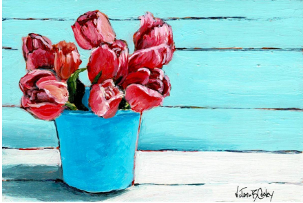
"Tulip Bouquet" 4" x 6"