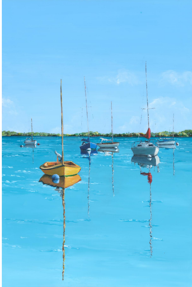
"Remains of the Day" 24" x 36" on canvas