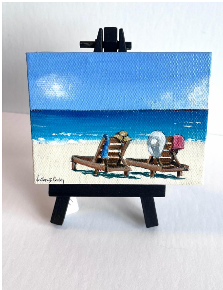
"Chillin'" 3" x 4"