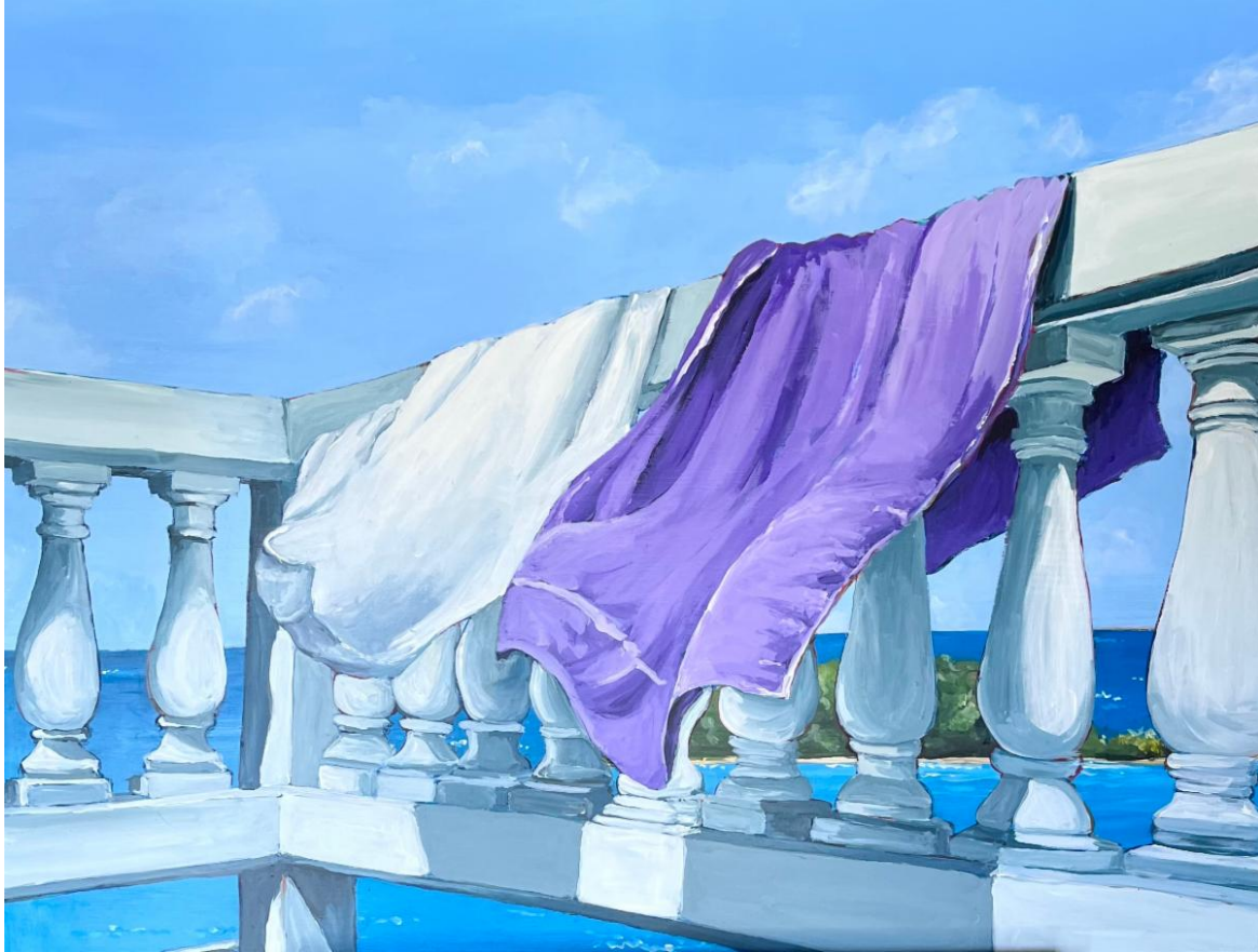
"Cool Breeze" 18" x 24" gesso board