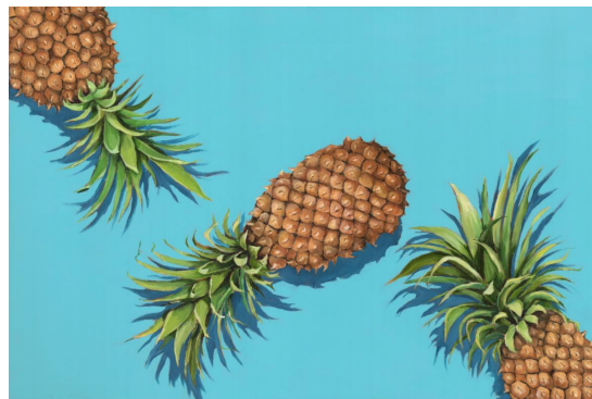
"Three's Company" 24" x 36" Acrylic