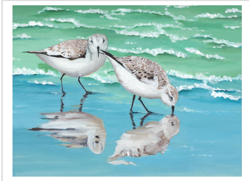
"Who, Me?" 18" x 24" Acrylic