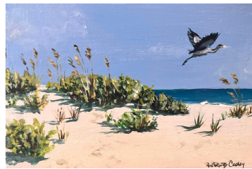
"Taking Flight" 5" x 7" Acrylic