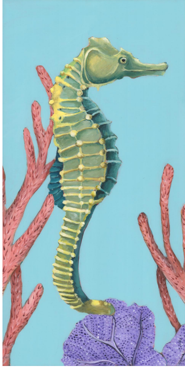
"Jack" 15" x 30" Acrylic