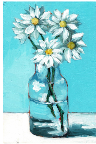
"Forget Me Nots" 5" x 7" Acrylic