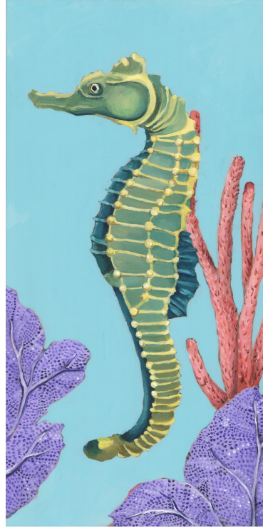
"Jill" 15" x 30" Acrylic