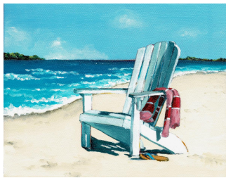
"Secret Beach" 8" x 10" Acrylic