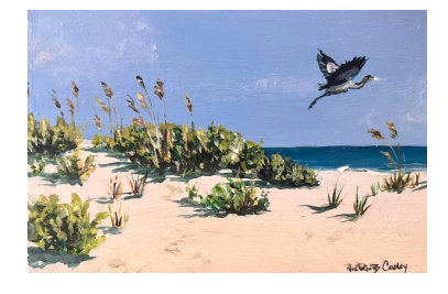
"Taking Flight" 5"x 7" Acrylic