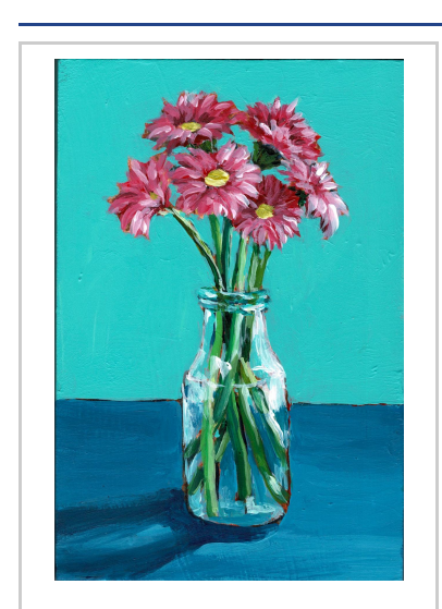
"Gerbers" 5" x 7" Acrylic