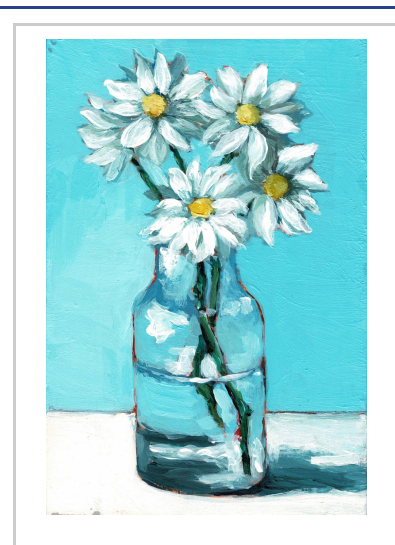
"Forget Me Nots" 5" x 7" Acrylic