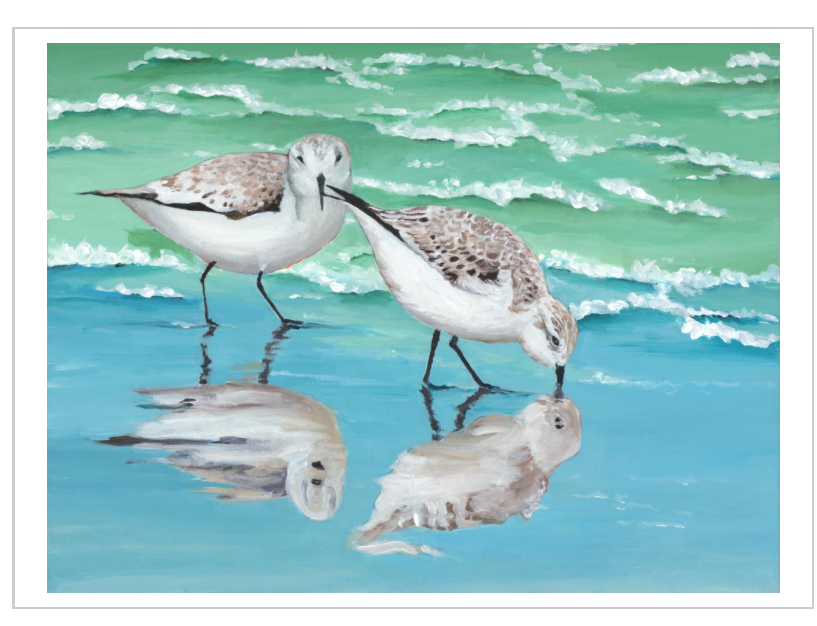
"Who, Me?" 18" x 24" Acrylic