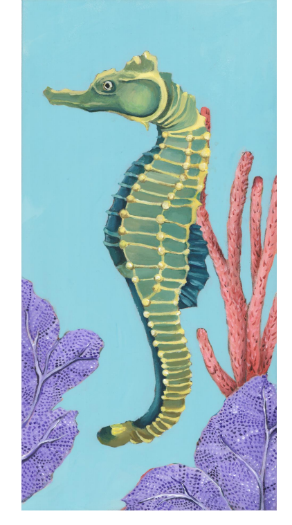
"Jill" 15" x 30" Acrylic