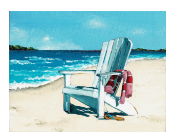
"Secret Beach" 8" x 10" Acrylic