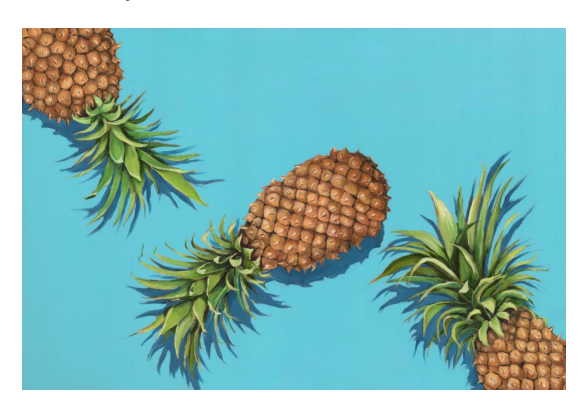
"Three's Company" 24" x 36" Acrylic