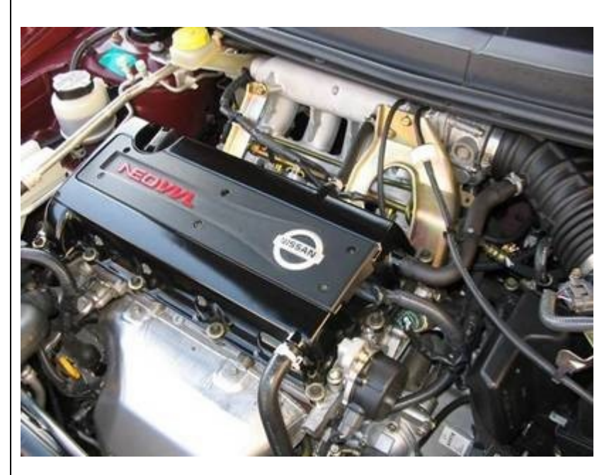
The engine below is specifically excluded: HP 5.12