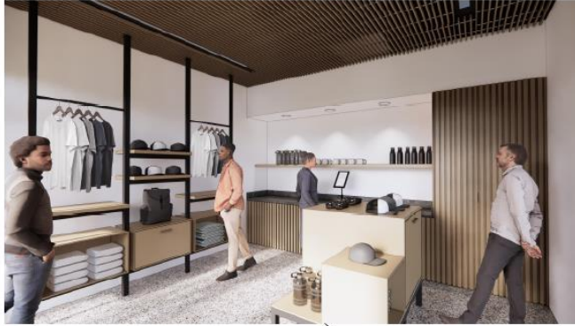
LEVEL 1 - MERCHANDISE STORE