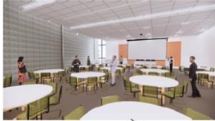
LEVEL 1 - LECTURE HALL