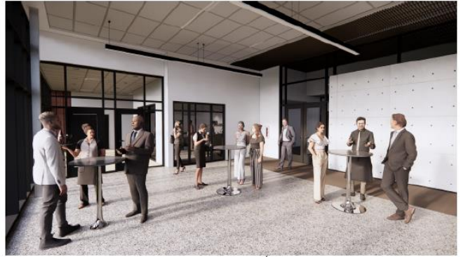
LEVEL 1 - PREFUNCTION AREA