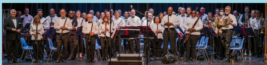
Tidewater Winds Concert Band The Full 55-Member Band