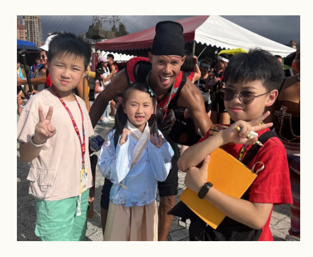
Dragon Boat Festival Support