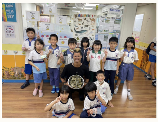
Making Zongzi (粽子) with the students.