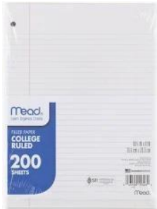
1 pack of college ruled paper