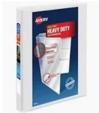
1 - 3 Ring Binder