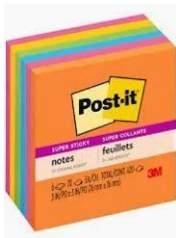
1 pack of post it notes