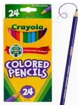
1 pack colored pencil