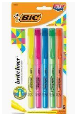
1 pack highlighter