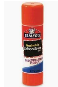
1 pack glue stick