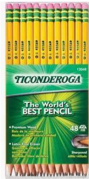
2 dozen Ticonderoga Pencils Sharpened