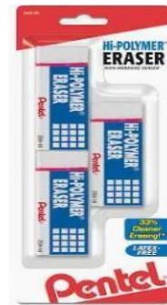
1 pack pentel erasers