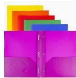
5 plastic folders