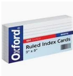
1 pack index card