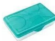
1 supply box