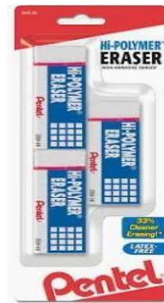
1 pack Pentel erasers