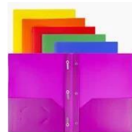
5 plastic folders