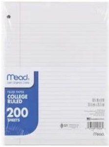
1 pack of college-ruled paper