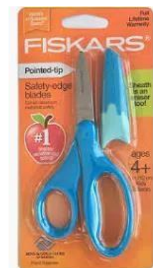
1 pair of Fiskar scissors for kids