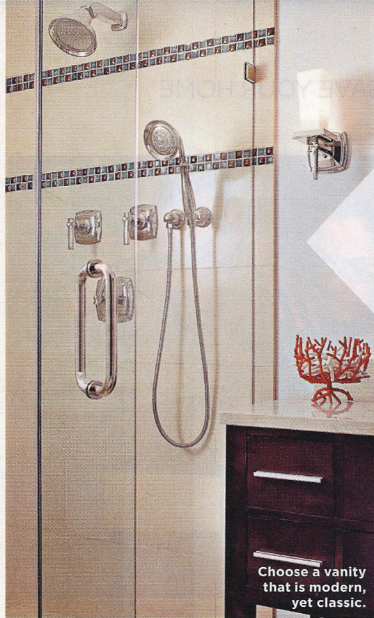
Choose a vanity that is modern, yet classic.