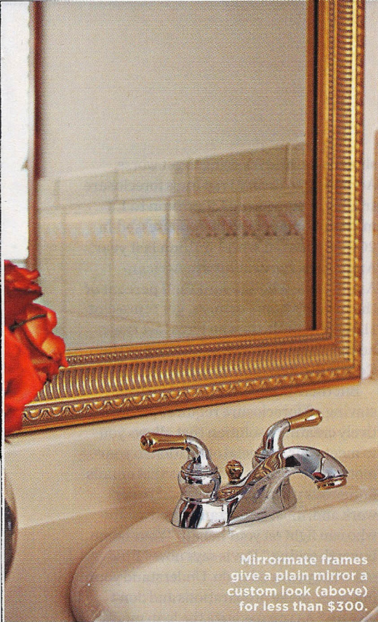
Mirrormate frames give a plain mirror a custom look (above) for less than $300.