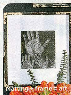
Matting + frame = art