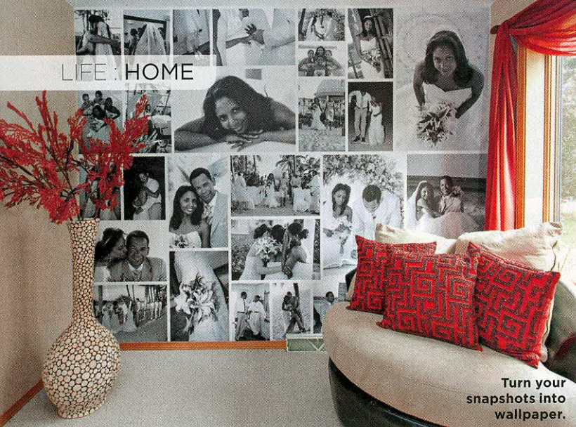
Turn your snapshots into wallpaper.