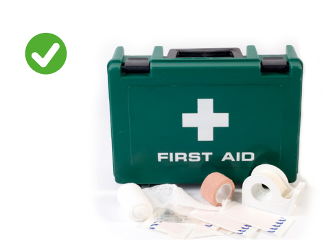
Know what to do if you accidentally spill the chemical on yourself or others