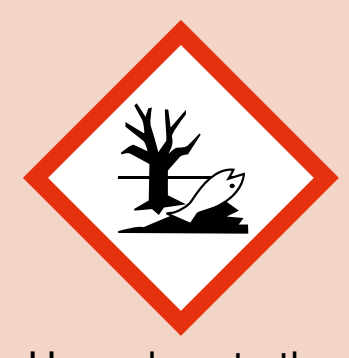
Hazardous to the Environment