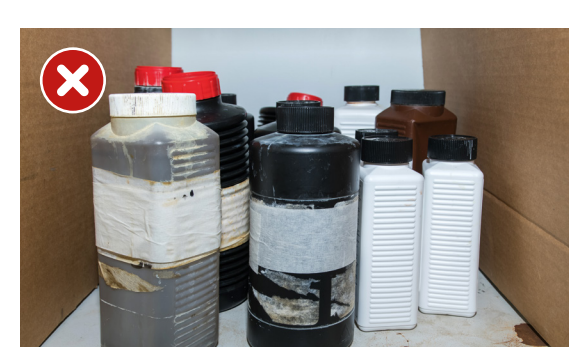
Don't store chemicals in unmarked containers