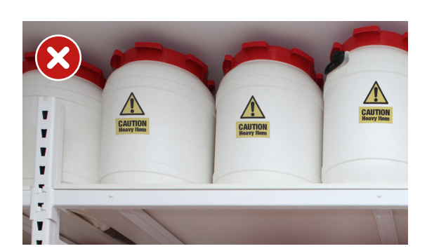
Don't place heavy containers on high shelves