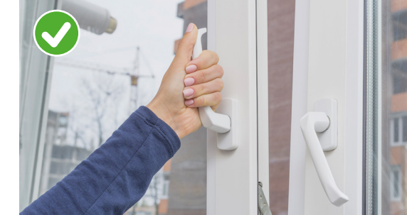
Keep the workplace well ventilated