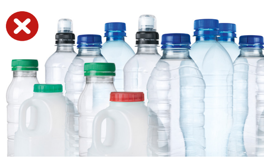
Don't store chemicals in bottles or containers designed for other uses (for example food and drink containers)