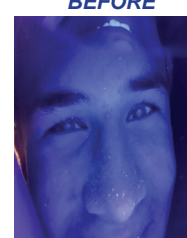
Woods Lamp BEFORE

White spots are bacteria and future acne blemishes