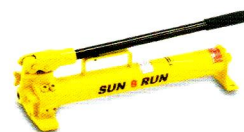
Hydraulic Manual Pump SPH series