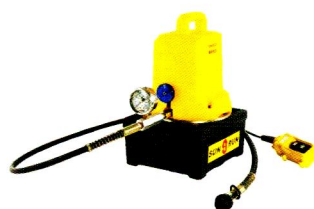
Hydraulic Electric Pump SPE-3000 series