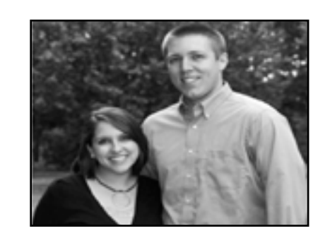
Preaching - January 26th

Mark your calendars! Congregational meetings will be held on Sunday, February 2 and Sunday, February 23 from 9:00 - 10:30am in the Chapel.