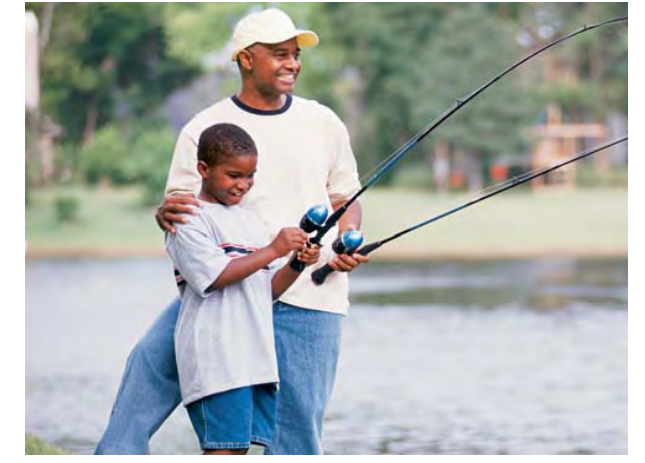
Fishing sinkers are one of the most common and readily accessible sources of lead exposure for older children and adults.