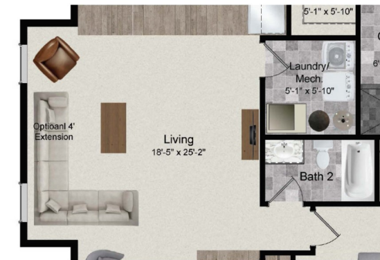
Family Room Extension