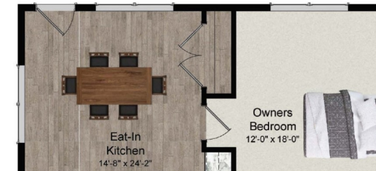
Morning Room & Master Bedroom Extensions