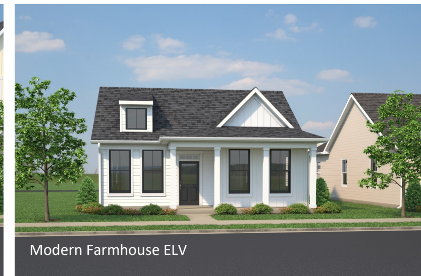
Modern Farmhouse ELV