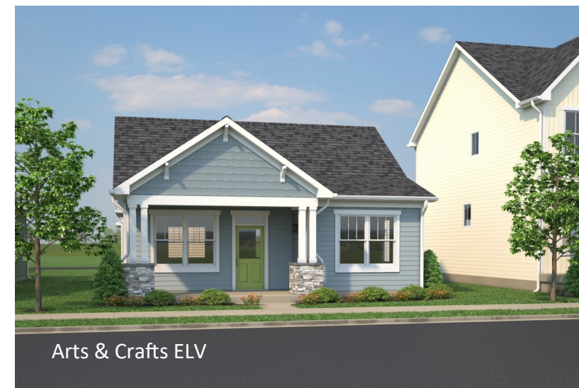
Arts & Crafts ELV