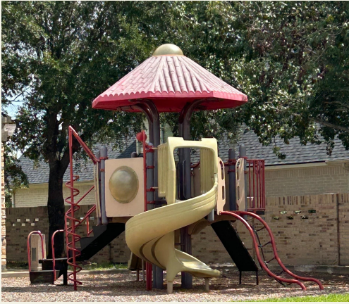
Playground improvements next budget year