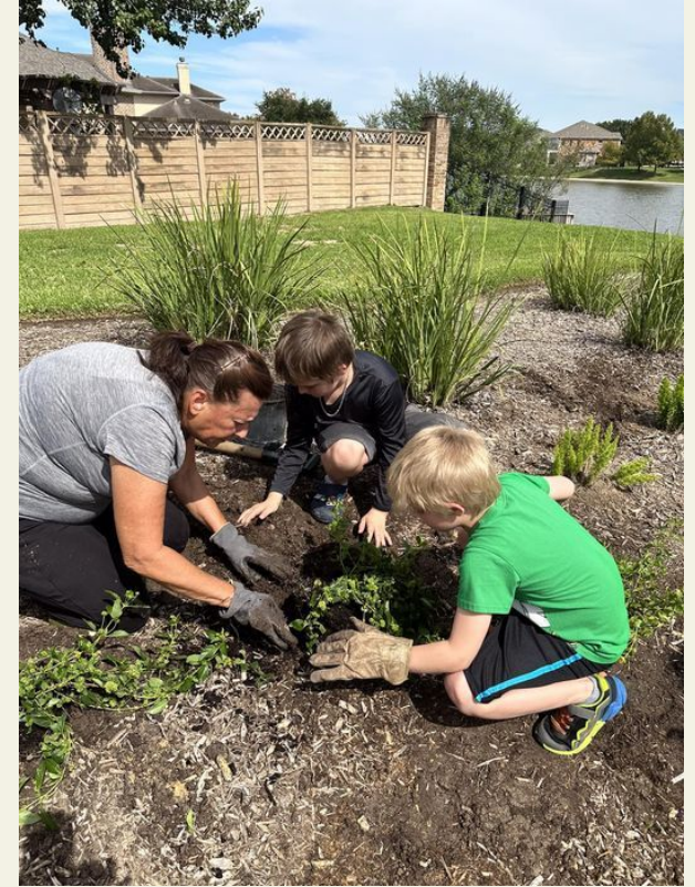
Flower bed replacement throughout community