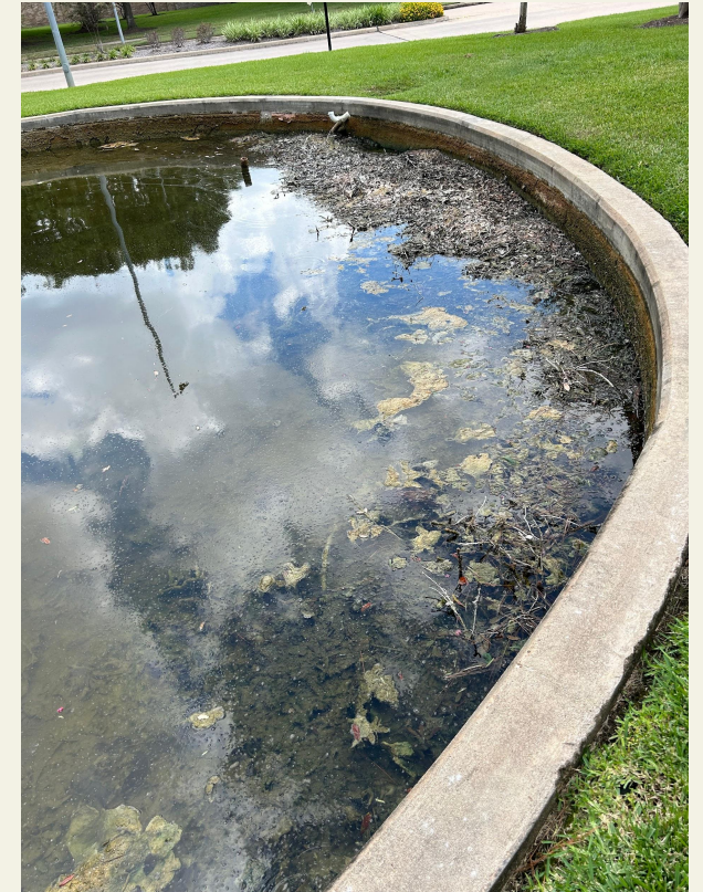
Amenity Lakes (front 2) Cleaning - Josh, project leader