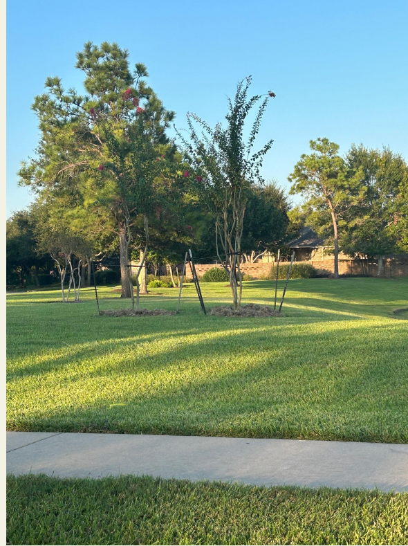
Tree replacements throughout community