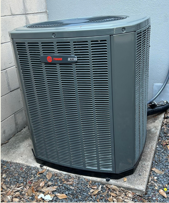
New AC at Clubhouse