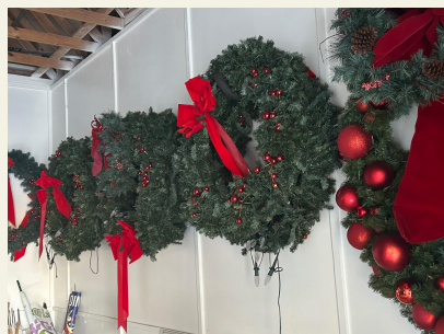
Christmas Light Install Wreath Hanging at Entrances and Clubhouse

The following acts of kindness and volunteerism were initiated by OUR neighbors: