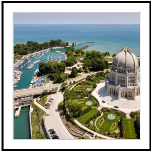
The Baha'i temple