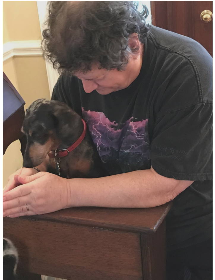
Herr Nikolai Von Klaus (aka Nickee) at our antique prayer bench. He felt right at home being the “Amen Choir” for our prayer time during last week’s FaceTime service.