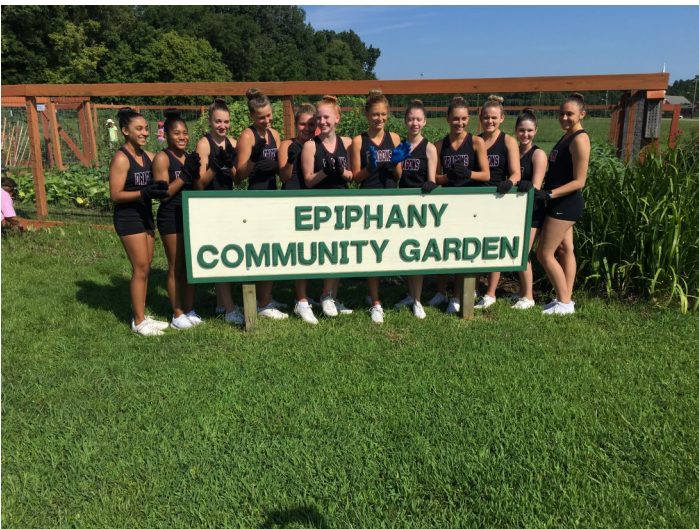
Collierville Varsity Pompon Squad

The Collierville Middle School and Varsity Pompon squads joined us at two different times this month - we are so grateful for their help!