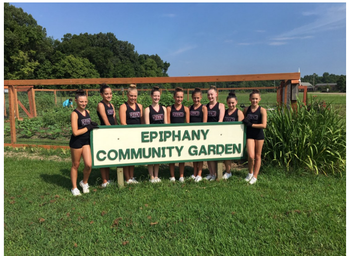
Collierville Middle School Pompon Squad