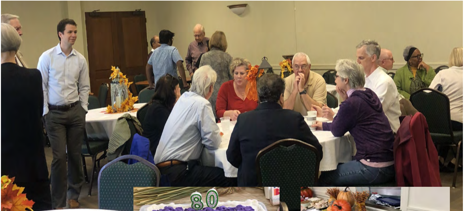
Celebration of Abundance on November 10th