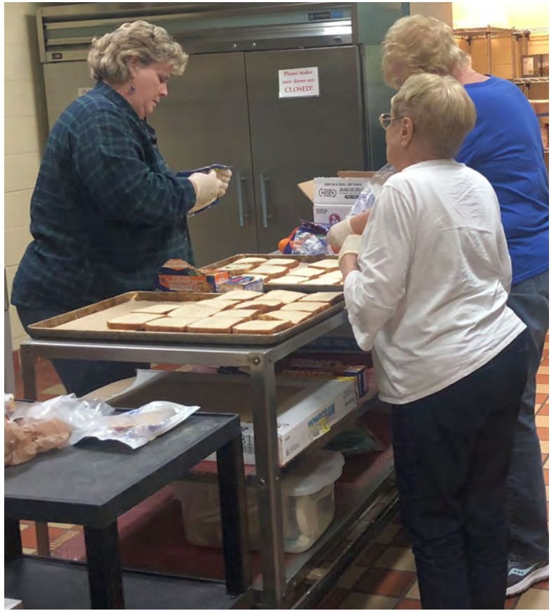
Preparing meals for Room in the Inn on 11/18