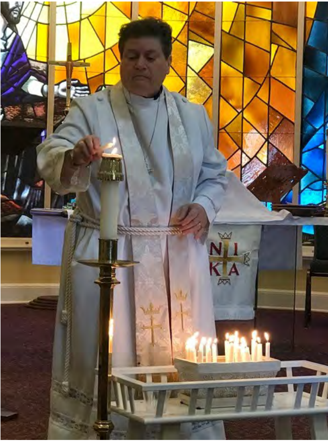
Remembering our loved ones on All Saints Day