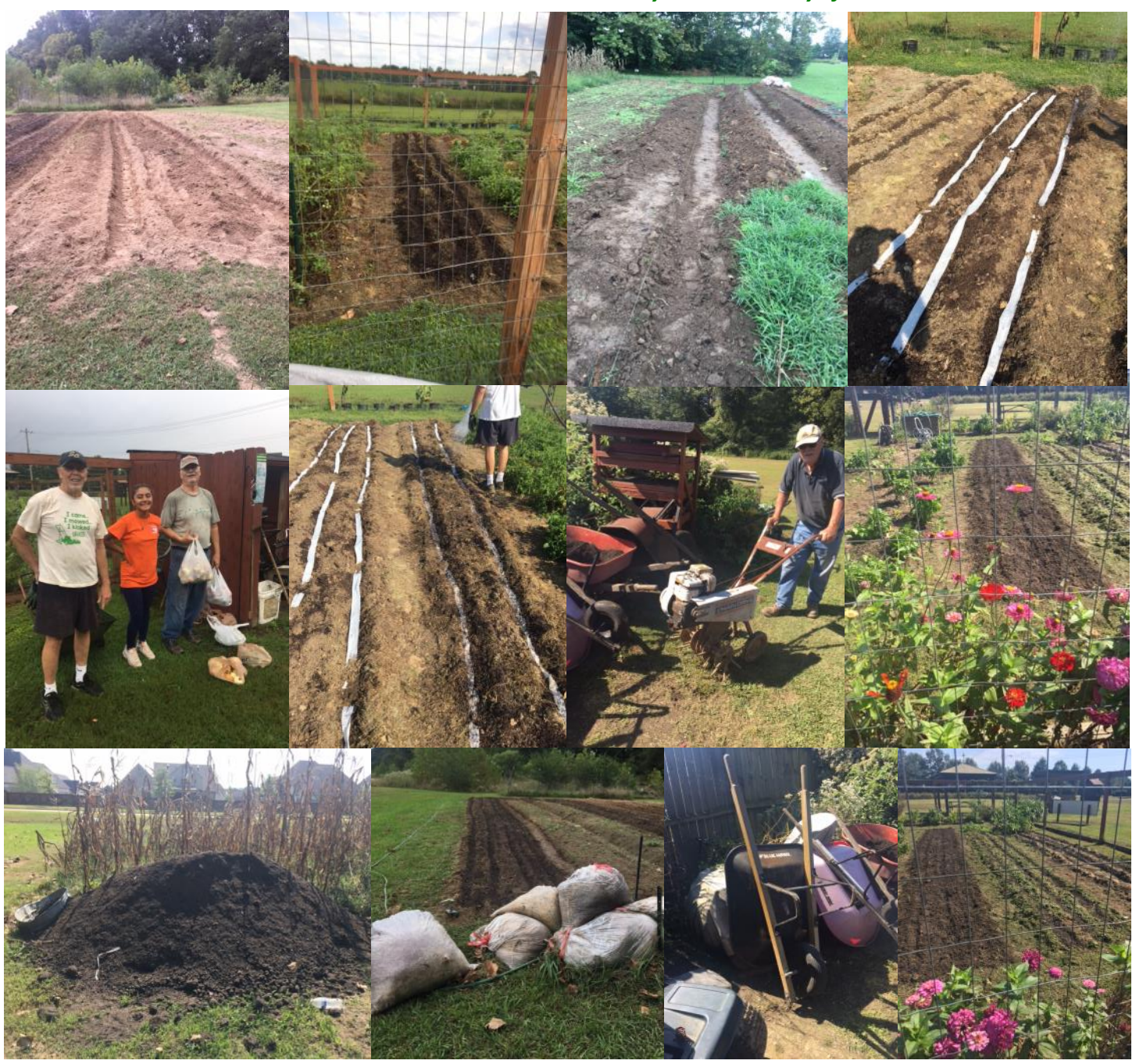
2,409 pounds of fresh veggies harvested and donated to area ministries as of September 29th!

Thanks to all our volunteers! Come work with us Wednesdays and Saturdays from 8:30 am - 11:30 am!