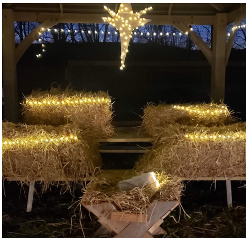
Interactive Nativity Scene