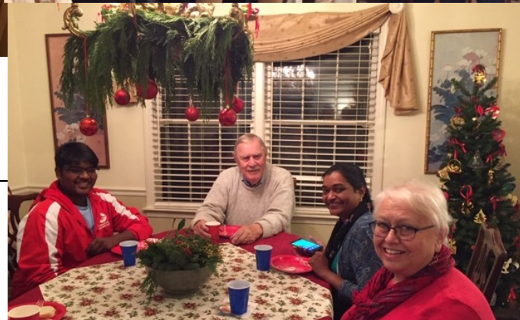
Christmas Fellowship and Party!