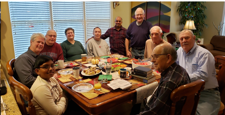
Men of Epiphany Breakfast