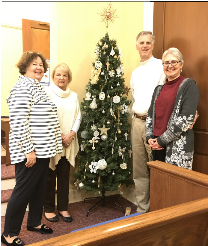
Decorating the Christmas Tree