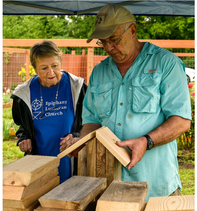
The Bee House Build was a huge success! Many thanks to everyone who came out for this fun event (and at least the rain held off for a few hours!)

I am a creative person who enjoys making clothing and various other craft projects when I have time from taking care of grandchildren.