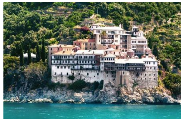
The Monastery at Mount Athos