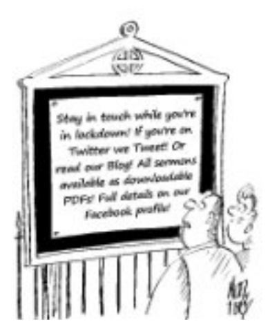
"...and we used to grumble about not understanding archaic church language!"