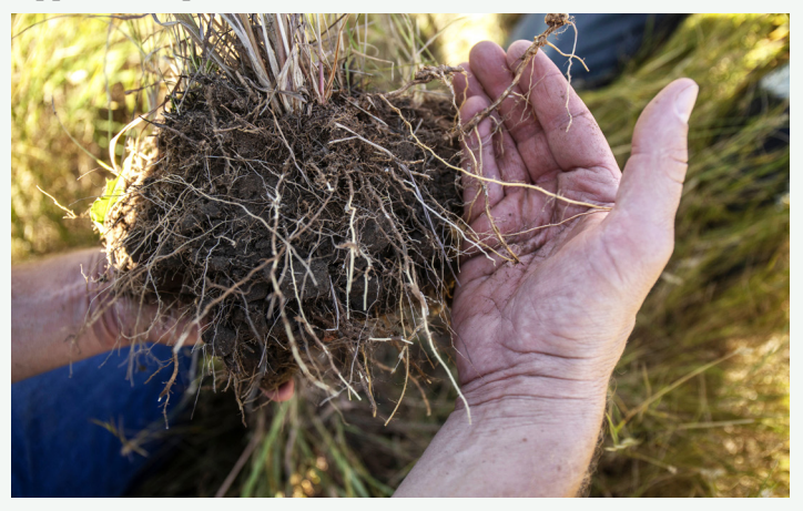
It's just as important to allow roots time to recover after grazing, especially during a drought, as it is to give plant leaves time to regrow and recover.

Ranchers and farmers with experience in rotational grazing learn to recognize when plants are fully recovered and ready to graze again. In general, that's when your desired grass species are at the 4½ leaf stage, and about 8 inches tall. How long that recovery takes depends on soils, soil moisture, time of year, species, how short it was grazed, and other factors.