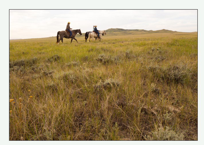
Britton Blair and his dad and uncle have seen significant changes in forage diversity, rainfall infiltration, and grassland resilience over the past 20 years by using more intense rotational grazing.