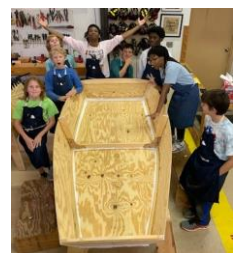
Celebrating the completion of the hull.