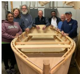
Members of the 2023 Adult Boatbuilding Class proudly display the beautiful rowboat they constructed.

Classes are held 6 to 8 pm on Thursday evenings at the workshop. The course begins January 25, 2024 and runs through June. This is a beginner's-level course; prior woodworking experience is helpful but not necessary. Students will learn to use both traditional hand tools and power tools while building a 12-foot Bevin's Skiff rowboat. Cost is $400 per person (additional family members pay half price). The money supports our youth boatbuilding programs. Not only will you learn to build a boat, but you will also be supporting a worthy cause! Class size is capped at 10 students, so call or email us today to register.