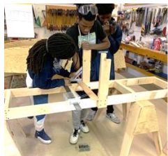
Constructing the ladder frame used to build a boat.

TWBW has again set a record for the number of students participating in our fall program. Over 70 young boatbuilders have been busy constructing three rowboats. For this trimester, we have introduced a new design called a pram. A pram is a small dinghy with a flat bow panel rather than a pointed bow. For sailing enthusiasts, the hull shape is very similar to an Optimist sailboat. We have patterned our design after an old, decaying fiberglass pram left at our shop several years ago. Our students have made great progress building this new design as the photos below show.