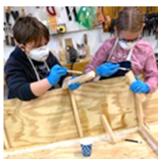
Installing the seat supports