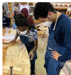
Using a hand plane to shape a transom panel.