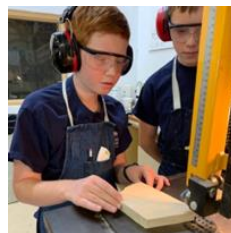
Cutting out a quarter knee on the bandsaw.