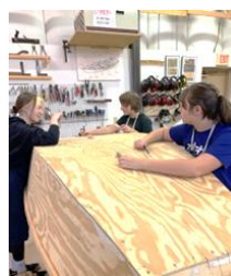
Laying-out the location for installing the keel.