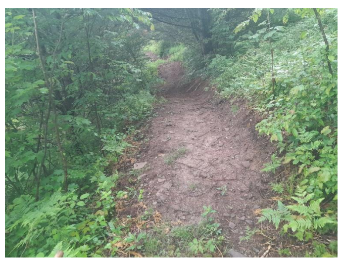
Osborne Branch Sidehill Work