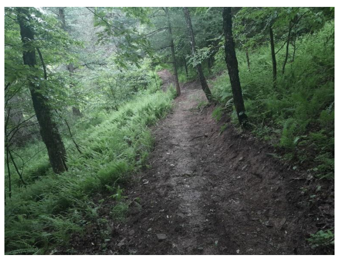
Osborne Branch Sidehill Work