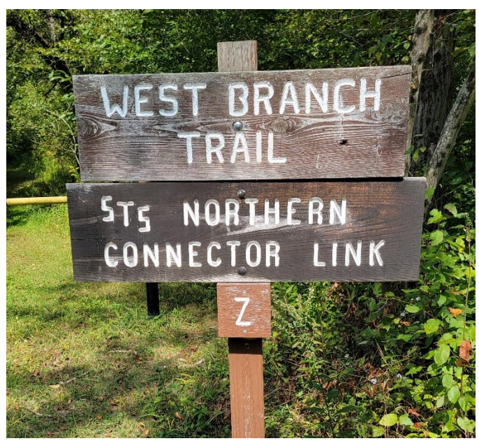
Another trail sign brought back to life by repainting the letters. Work and photo by Larry Holtzapple